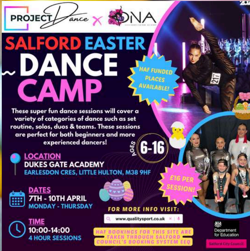
Salford Lowry Dance sessions over Easter Holidays