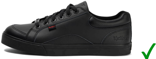
Examples of Inappropriate school shoes